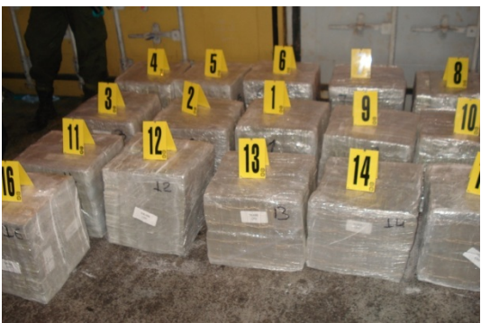
An Immigrations and Customs Enforcement-led investigation seizes $41 million payment for cocaine hidden in fertilizer shipments from Mexico to Colombia.

At the same time, Colombia has made great strides to combat money laundering. The Colombian National Police is among the best regarded services in the world with respect to their anti-money laundering efforts. Former Colombian security officials stressed the importance of having a professionalized police force, close cooperation with the U.S. government, and strong financial intelligence units for effective anti-money laundering work. Colombia has also been effective as a result of its strong asset forfeiture law. Colombia's success in combating drug-related money laundering should serve as a model for other countries.