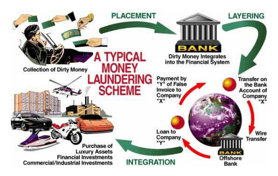
The Money Laundering Cycle

This section will review the main steps involved in money laundering by transnational criminal organizations.