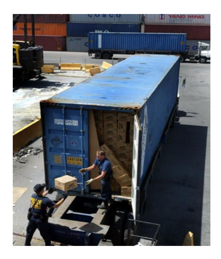
Law enforcement officers inspects suspect shipping container

Trade based money laundering commonly involves invoice fraud. The quantity, quality and price of the goods sold are manipulated. Under and overvaluation of traded goods can allow money launderers to settle debts. For example, a money laundering facilitator can value exported goods as $200,000 when they are actually worth $100,000. The recipient of those goods will then pay $200,000 to the sender which includes a $100,000 payment to the sender on top of the goods' actual value.<sup>32</sup>